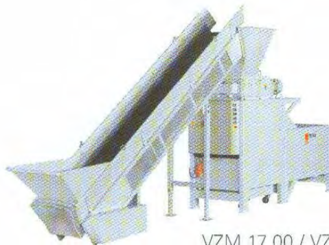
VZM 17.00 / VZM 18.00 Inline set-up