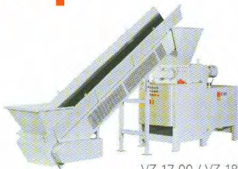
VZ 17.00 / VZ 18.00 Inline set-up